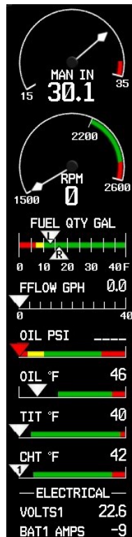
Figure SB M20-342-3 - Updated EIS Strip TIT Display