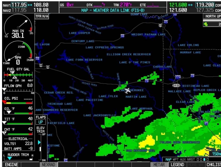
Figure SB M20-342-4 - Example ADS-B FIS-B NEXRAD Display

THIS BULLETIN DOES NOT CHANGE AIRCRAFT TYPE DESIGN