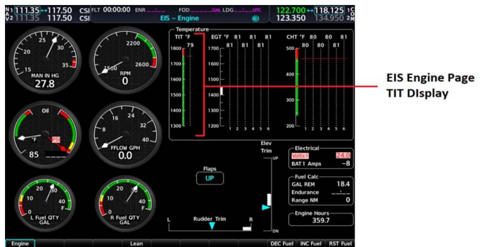
Figure SB M20-342-1 - Current EIS Page TIT Display

Figure SB M20-342-1 Illustrates the current configuration of the EIS Engine Page.