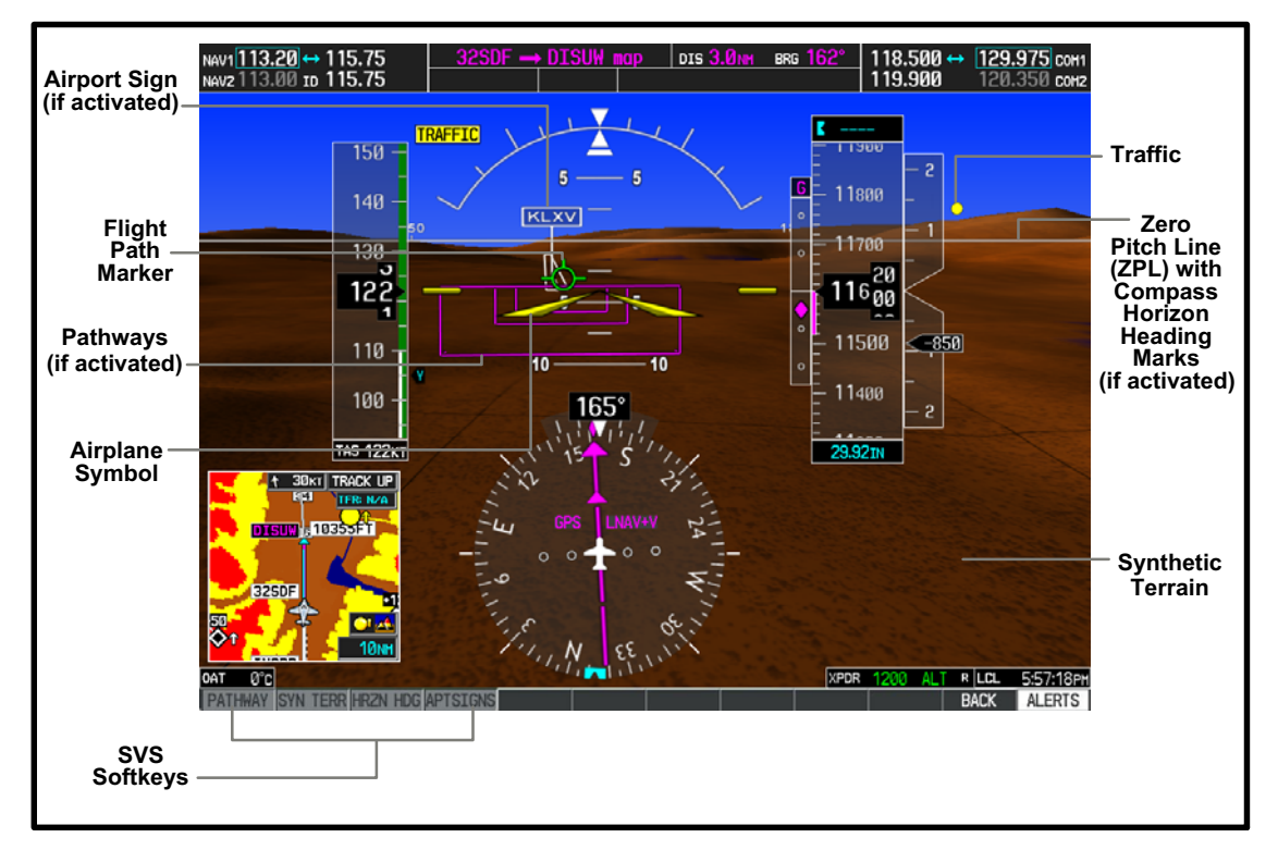
FIGURE 1-2 SYNTHETIC VISION ON PRIMARY FLIGHT DISPLAY