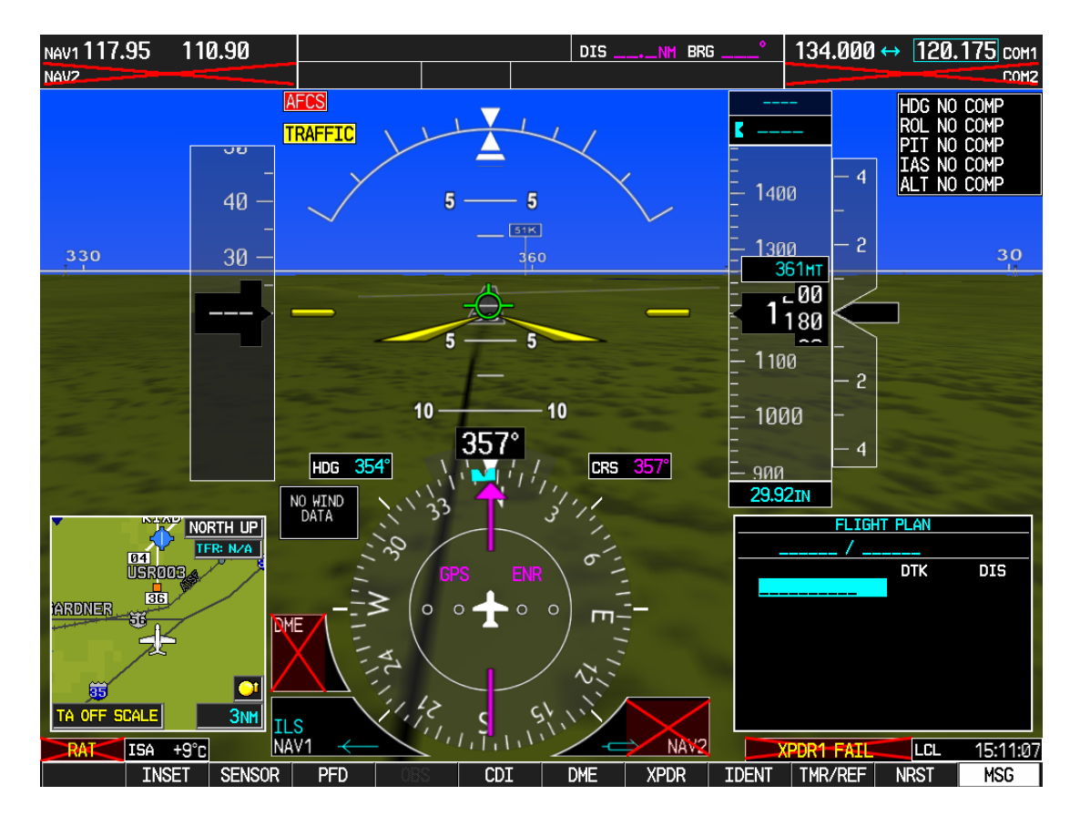
FIGURE 1–3 Runway Depiction with Zero Altitude Error

To conduct the simulation, altitude was artificially adjusted to reproduce the runway depiction that might be seen with the various runway and airport field elevation differences while holding the above variables constant. The following screen shots provide a sample comparison of the PFD display of SVS runways at 200' AGL and 2800' from the runway threshold: