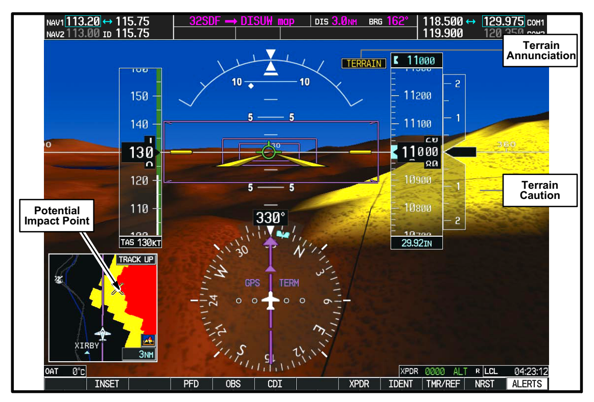
FIGURE 1–6 TERRAIN ALERT

Terrain alerting on the synthetic terrain display is triggered by Forward–looking Terrain Avoidance (FLTA) alerts, and corresponds to the red and yellow X symbols on the Inset Map and MFD map displays. For more detailed information regarding Terrain–SVS and TAWS, refer to the Hazard Avoidance Section. In some instances, a terrain or obstacle alert may be issued with no conflict shading displayed on the synthetic terrain. In these cases, the conflict is outside the SVS field of view to the left or right of the aircraft.