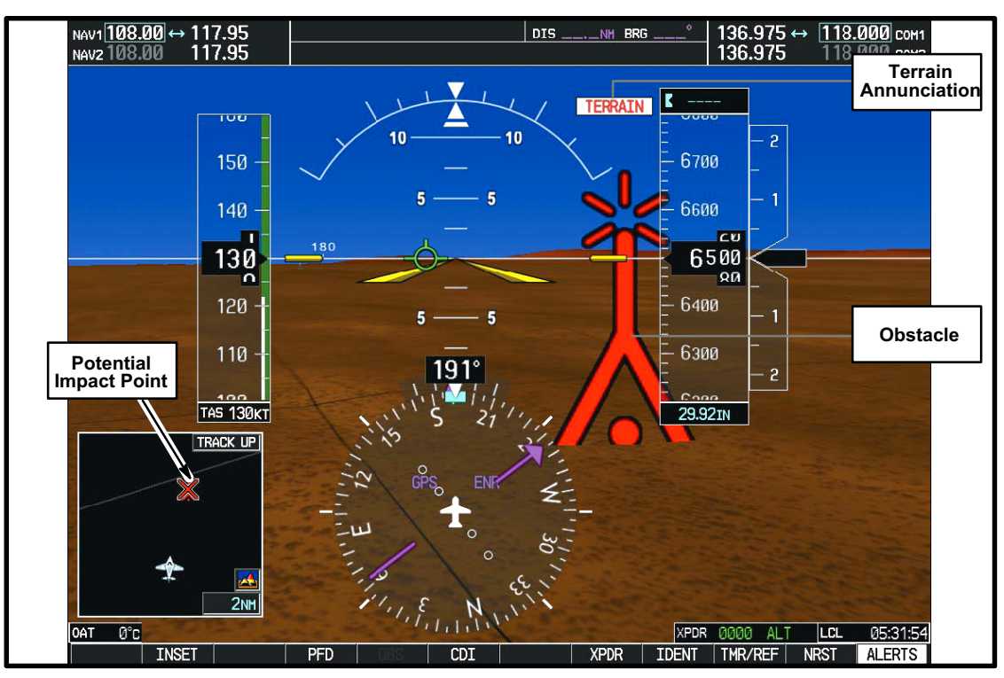
FIGURE 1-7 OBSTACLE ALERT

Obstacles are represented on the synthetic terrain display by standard two-dimensional tower symbols found on the Inset map and MFD maps and charts. Obstacle symbols appear in the perspective view with relative height above terrain and distance from the aircraft refer to figure 1–7. Unlike the Inset map and MFD moving map display, obstacles on the synthetic terrain display do not change colors to warn of potential conflict with the aircraft's flight path until the obstacle is associated with an actual FLTA alert. Obstacles greater than 1000 feet below the aircraft altitude are not shown. Obstacles are shown behind the airspeed and altitude displays.