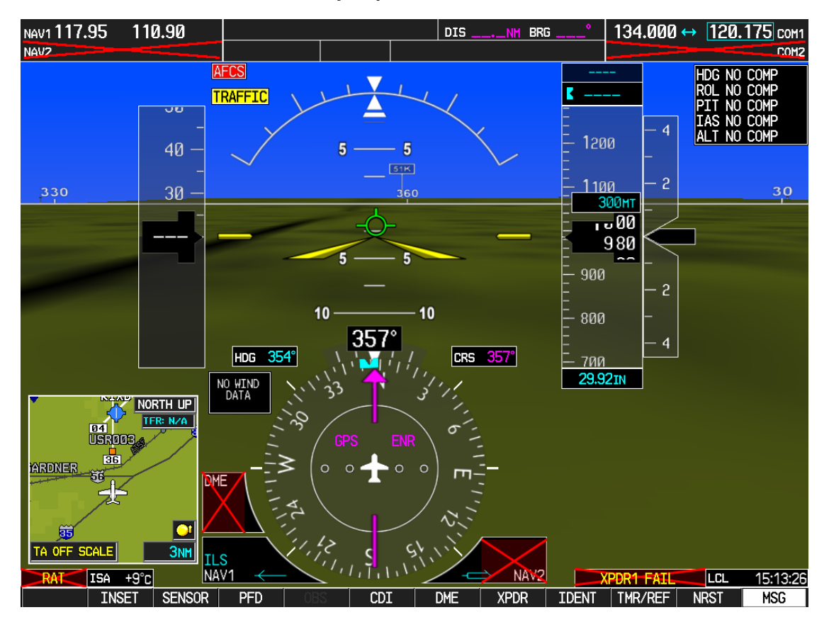
FIGURE 1–5 Runway Depiction with 200' Altitude Error