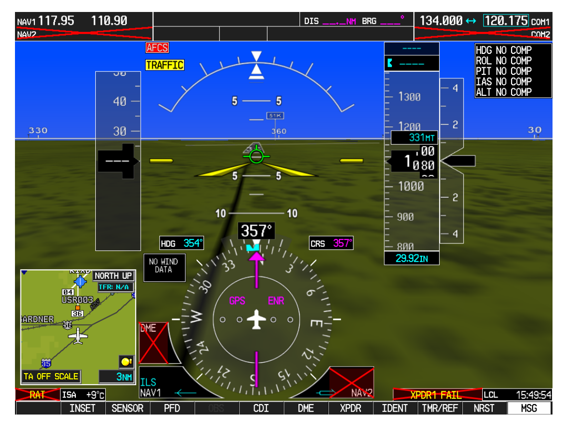
FIGURE 1-4 Runway Depiction with 100' Altitude Error