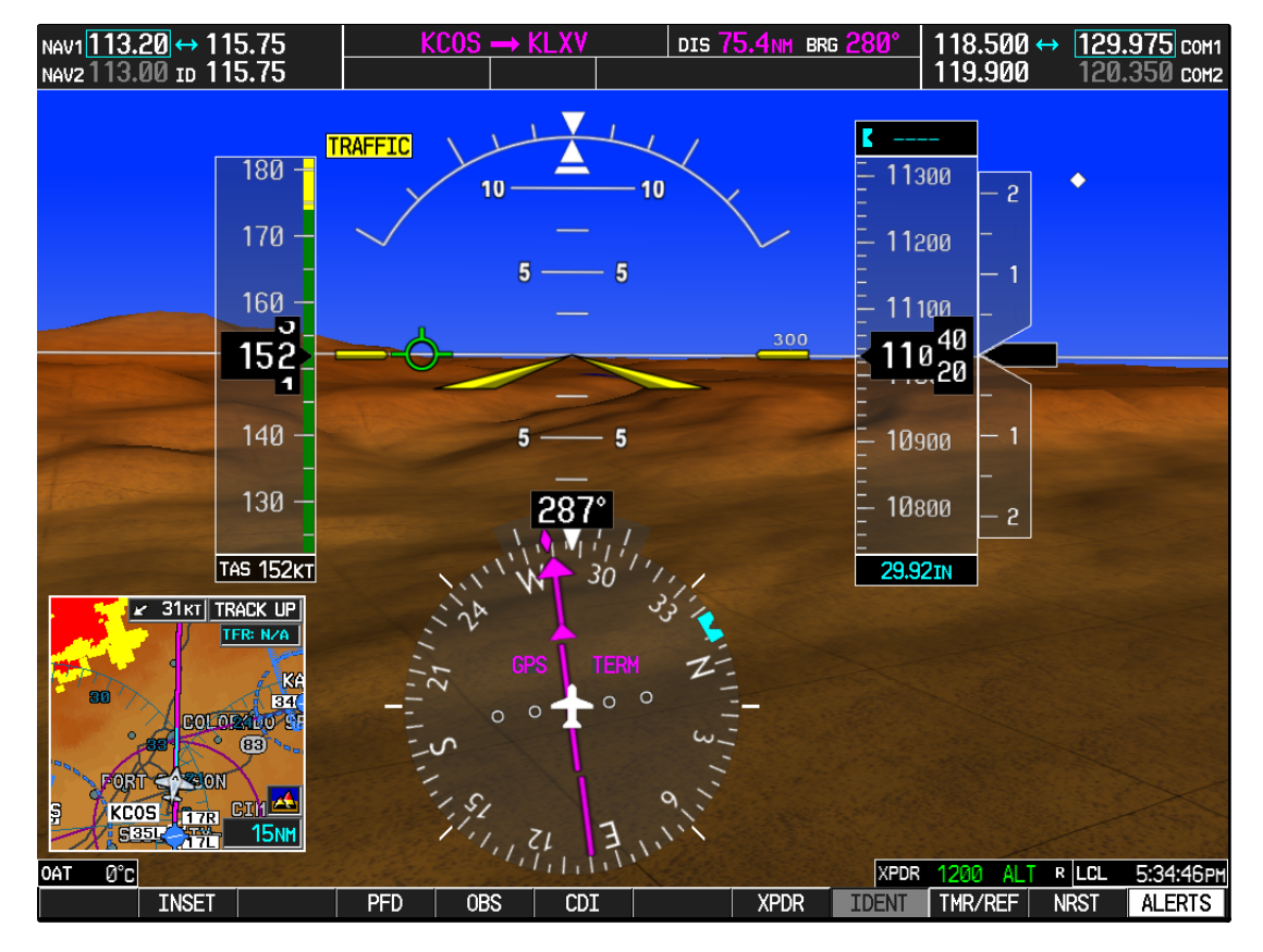
FIGURE 1–1 SYNTHETIC VISION IMAGERY SYNTHETIC VISION SYSTEM (SVS) – OPERATION

The SVS terrain display shows land contours, large water features, towers, and other obstacles over 200' AGL that are included in the obstacle database. Cultural features on the ground such as roads, highways, railroad tracks, cities, and state boundaries are not displayed even if those features are found on the MFD map. The terrain display also includes a north–south east–west grid to assist in orientation relative to the terrain. The colors used to display the terrain elevation contours are similar to that of the topo map display.