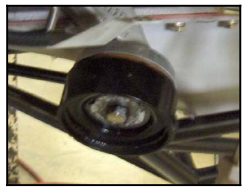
ISOLATOR MOUNT SEATED REMOVE - "DUMMY" BOLTS